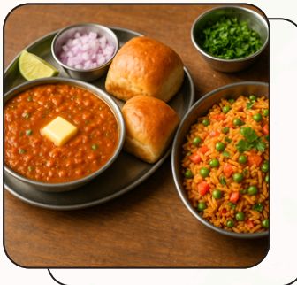
Pav Bhaji + Tawa Pulav