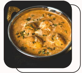
Malai Kofta Curry