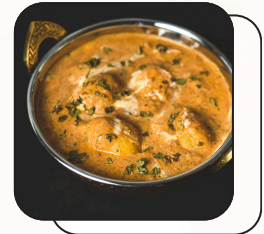
Malai Kofta Curry