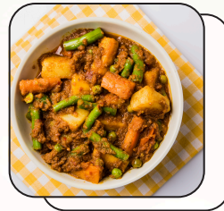
Mix Veg Masala