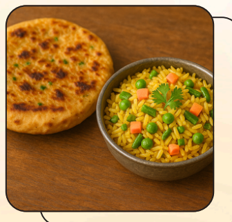
Aaloo Paratha + Pulav