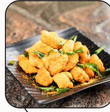
Sezwan Idly Fry