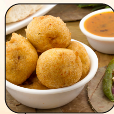
Batata Vada Sambhar