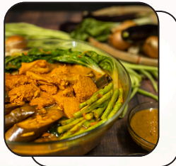
Vangi Kurma Bhaji