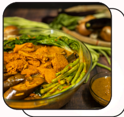
Vangi Kurma Bhaji