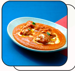
Paneer Tikka Masala