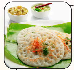
Set Dosa - Chutney