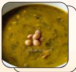
Aaloochi Patal Bhaji