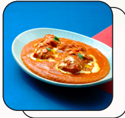
Paneer Tikka Masala