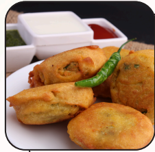
Batata Vada - Chutney