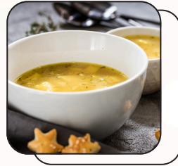
Lemmon Coriander Soup