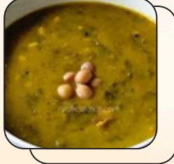
Aaloochi Patal Bhaji