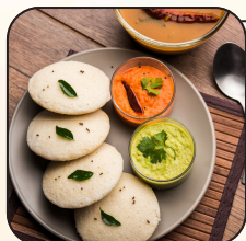
Idli (2) Sambhar Chutney