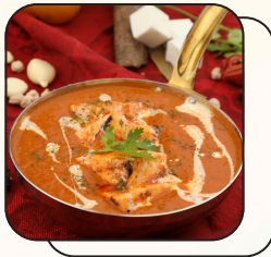
Paneer Butter Masala