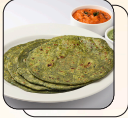
Palak Paratha - Chutney