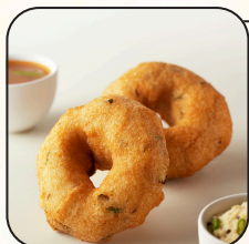
Medu Vada (2)