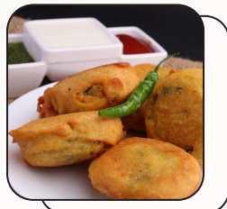
Mini Batata Vada