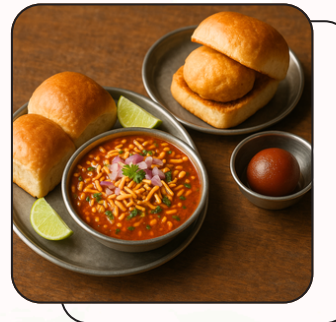
Misal Pav + Vada Pav+ Gulabjam